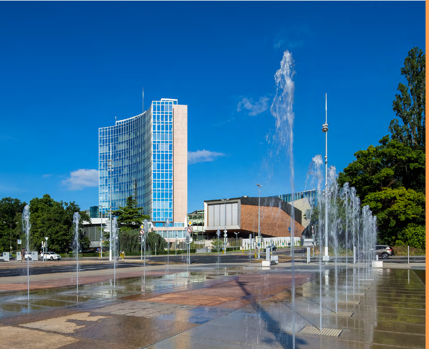
Headquarters building of the World Intellectual Property Organization (WIPO) in Geneva.