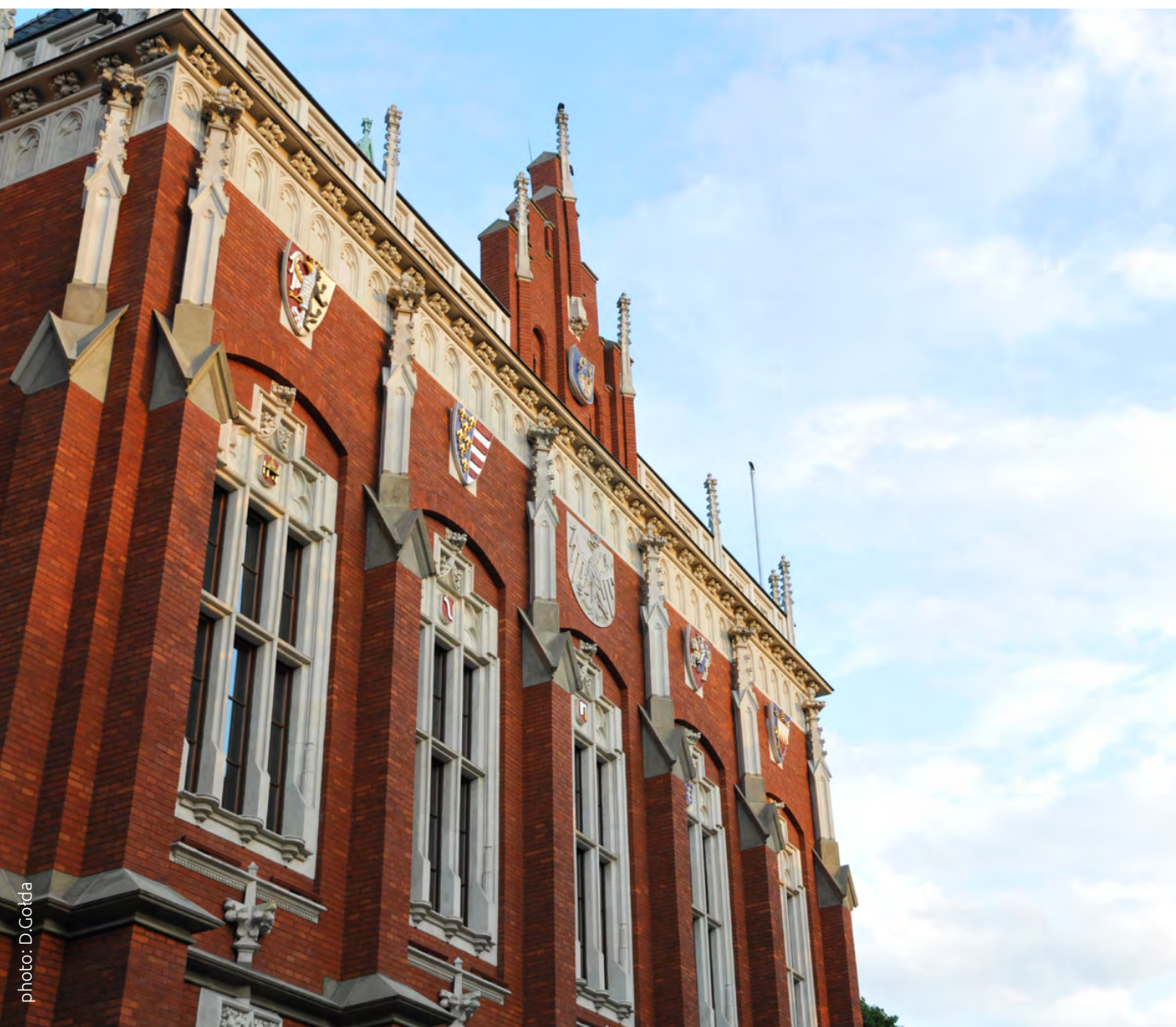
Main building of the Jagiellonian University in Kraków, built in 1873-1887.